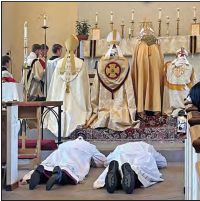
The bishops-elect prostrate themselves before their consecration.