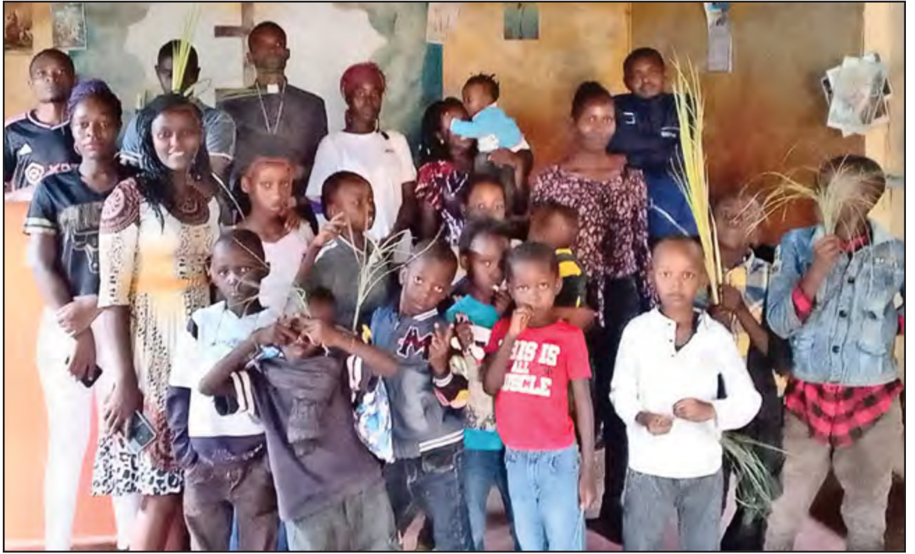
Palm Sunday at Good Shepherd Mission, Korogocho, Kenya.

Of the six elderly members of the Diocese that we considered an important part of this Mission, three have passed away, and the remaining are all sick unable to attend Mass or service regularly. In order to continue serving them with Eucharist at their homes and in hospital, we